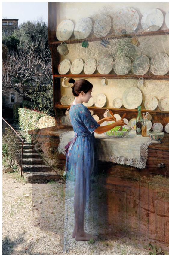
The Costume of Painter – 'The Lady with Dishes' | Lenticular | 2016 Edition of 10: 120 x 80 cm (47 x 31.5 in)

Bae Joonsung's paintings slip between worlds. He presents a synthesis of past and present, of reality and artifice, of naked and clothed. The images express the fragmentary and elusive nature of our perceptions. This makes us all the more determined to savour them.