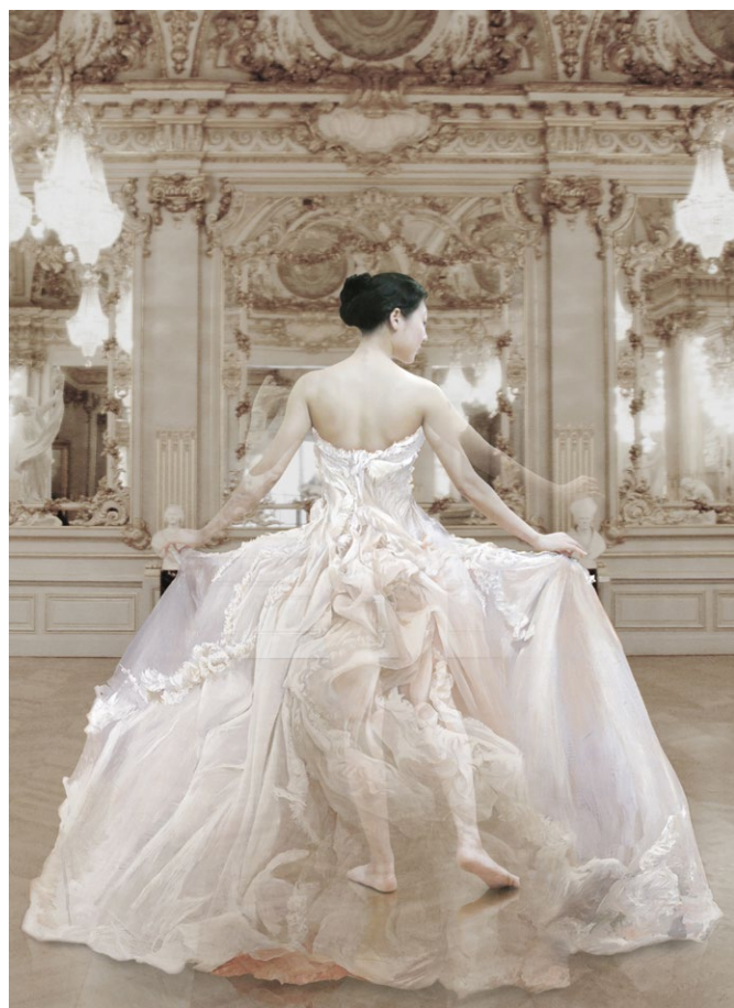
The Costume of Painter – C. Lacroix Wed 3D | Lenticular | 2015 Edition of 13; 82.5 x 60 cm (32.5 x 23.5 in) | Edition of 10; 110 x 80 cm (43.5 x 31.5 in)