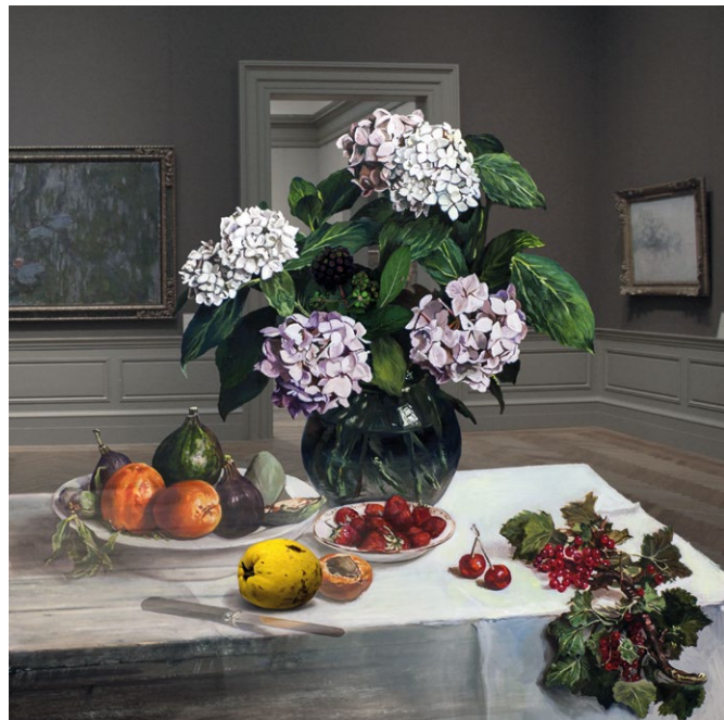
The Costume of Painter – Still Life With Strawberry 3D | Lenticular | 2016 Edition of 13; 70 x 70 cm (27.5 x 27.5 in)

National Museum of Art, Korea Gyeonggi Museum of Modern Art, Korea Seoul Museum of Art, Korea Korean Folk Village, Korea Severance Hospital, Korea BORYUNG Co. Ltd, Korea Ocsanga, Korea Centre Pompidou, France Beaux Art Museum, France