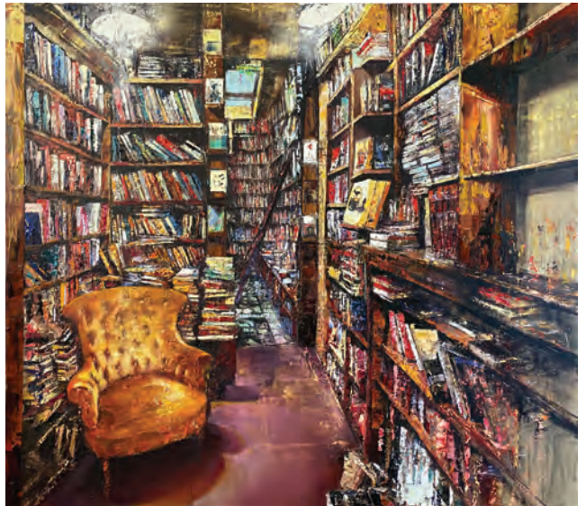
Poltrona gialla | 2020 | Oil on canvas | 150 x 170 cm (59.1 x 66.9 in)