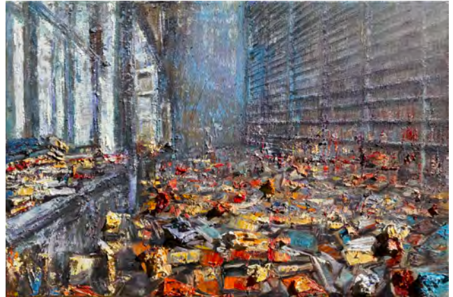
Studio naufragio | 2022 | Oil on canvas | 40 x 60 cm (15.8 x 23.6 in)