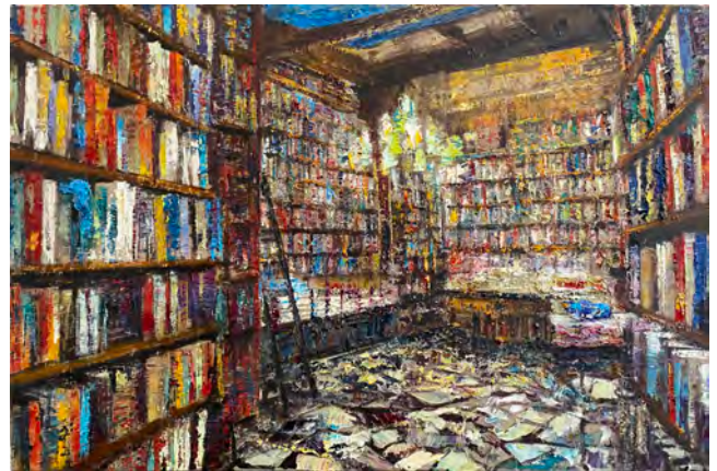
Shakespeare & co. | 2022 | Oil on canvas | 40 x 60 cm (15.8 x 23.5 in)