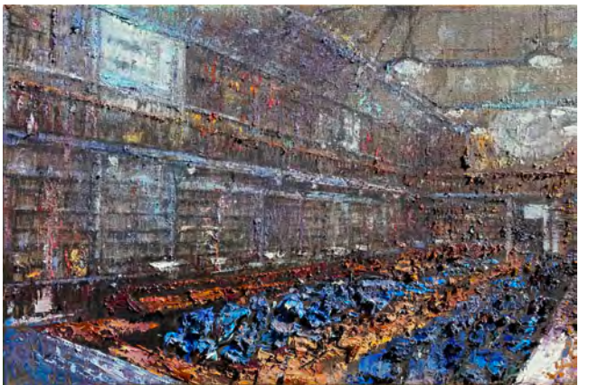
Magliabechiana Firenze, Uffizi | 2022 | Oil on canvas | 40 x 60 cm (15.8 x 23.6 in)