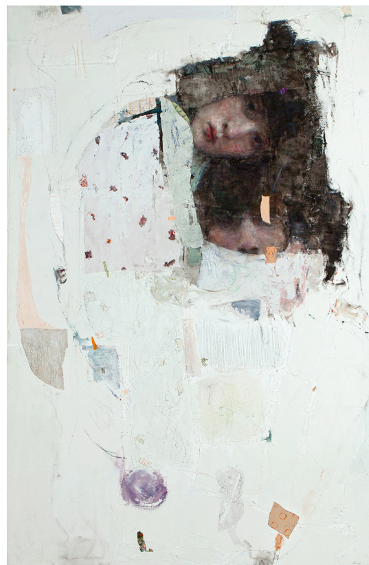
Quorum of Heart | 2019 Oil on linen canvas on birch panel | 143.5 x 94.6 cm