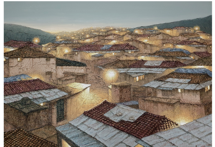
Predawn Path | 2020 Acrylic on Korean paper mounted on canvas | 65 x 91 cm