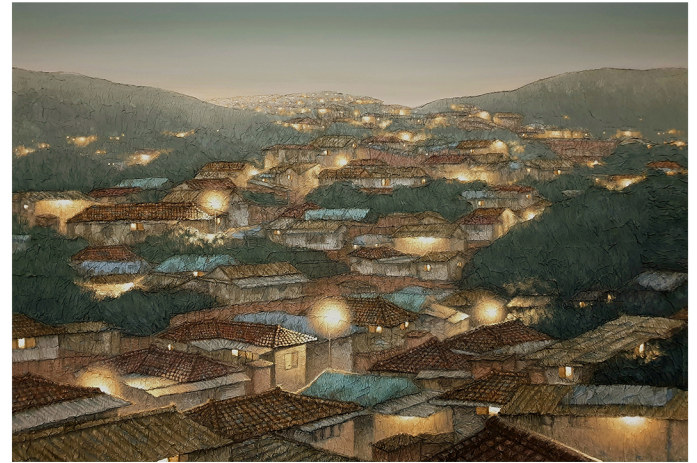
High Hills Village | 2020 Acrylic on Korean paper mounted on canvas | 80.5 x 116.5 cm

National Museum of Modern and Contemporary Art, Seoul Government Art Bank, Seoul PWC Office, Seoul Hong Kong Harbour City, Hong Kong Shanghai Bluepanda Network Technology Head Office, Shanghai