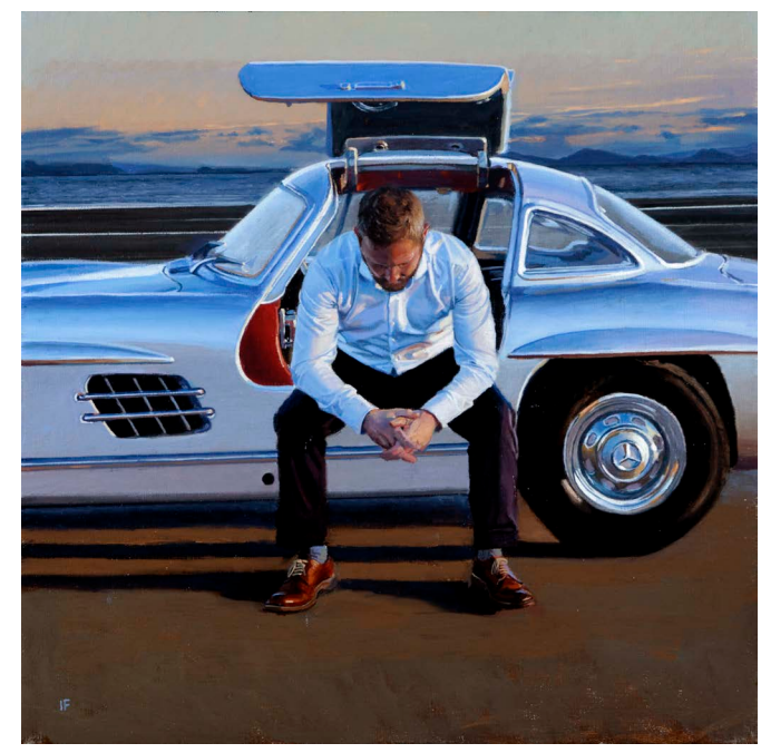
Pit Stop II 2017 | Oil on Canvas | 51 x 51 cm (20 x 20 in)