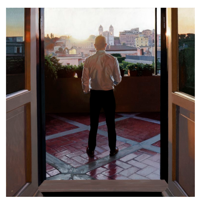
Rome, Sunrise 2017 | Oil on Canvas | 91 x 91 cm (36 x 36 in)

Prudential Corporation Standard Chartered Bank Royal Bank of Scotland Scottish National Portrait Gallery