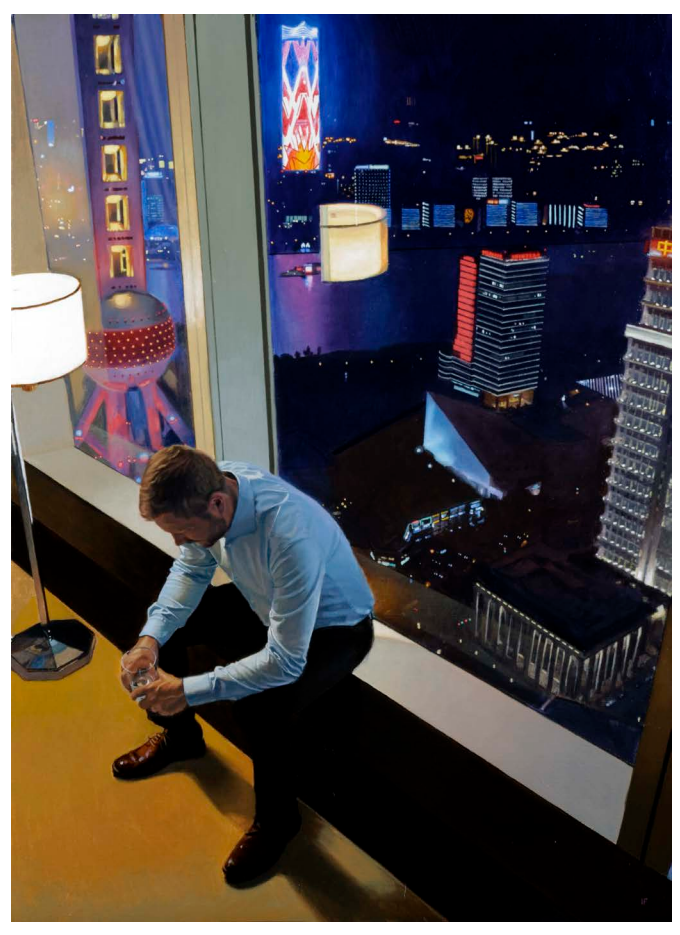
Shanghai Evening 2017 | Oil on Canvas | 102 x 76 cm (40 x 30 in)

These images are romantic. They conjure ideas of modern-day, male heroes. Solitary and brooding, these figures suggest alienation, but also speak of autonomy and resilience. They bring to mind Casper David Friedrich's 'Wanderer' or 'bandes dessinées' characters and even Ian Fleming's peripatetic Scot. There is a sense that these 'illustrated pauses' are strategic interludes where thoughts are ordered and decisions made before getting back into the saddle and re-joining the fray.