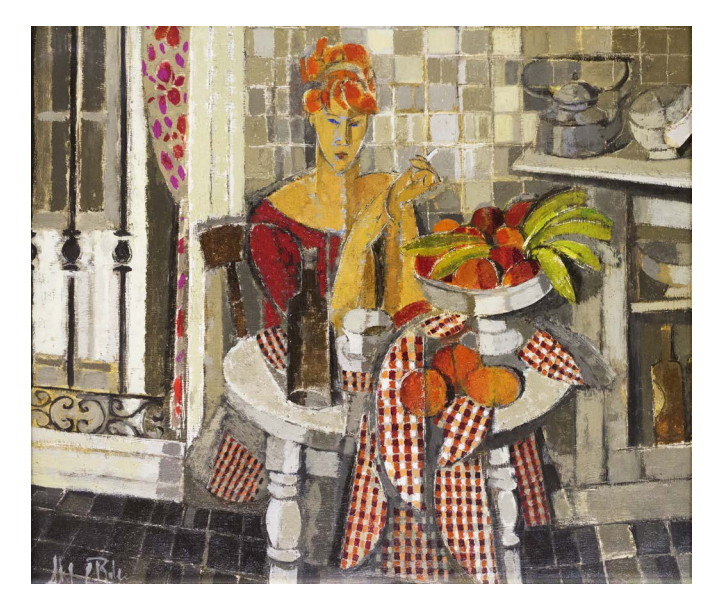
Interior de día | 2017 | Oil on board | 28 x 34 cm (11 x 13.4 in)