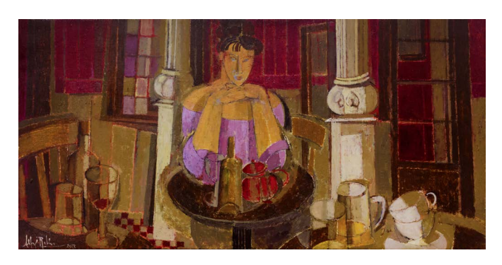
Zona privada | 2018 | Oil on canvas | 40 x 81 cm (15.7 x 31.9 in)