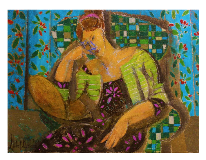
Sesteando | 2017 | Oil on canvas | 16 x 22 cm (6.3 x 8.6 in)