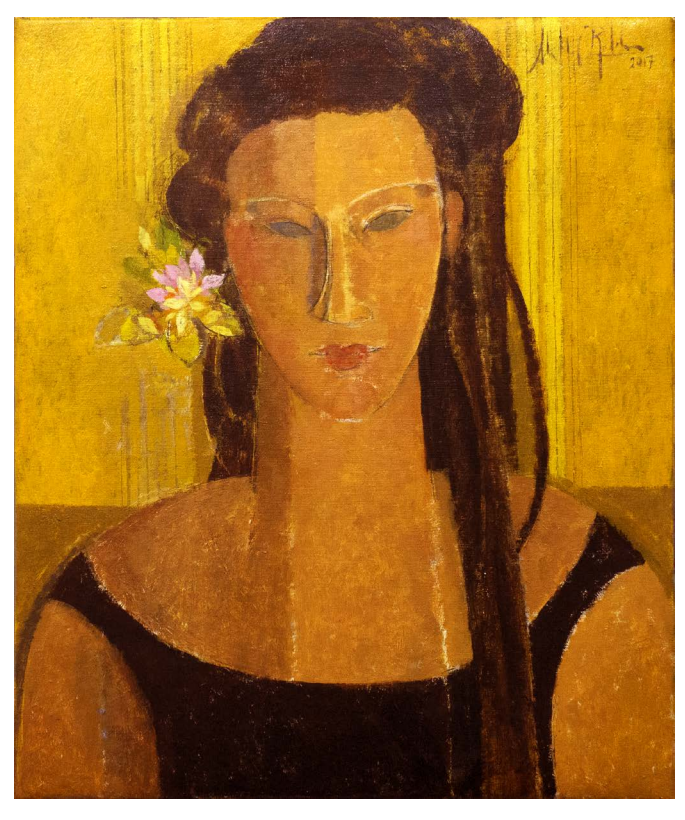
Mujer en amarillo | 2017 | Oil on canvas | 46 x 38 cm (18.1 x 15 in)