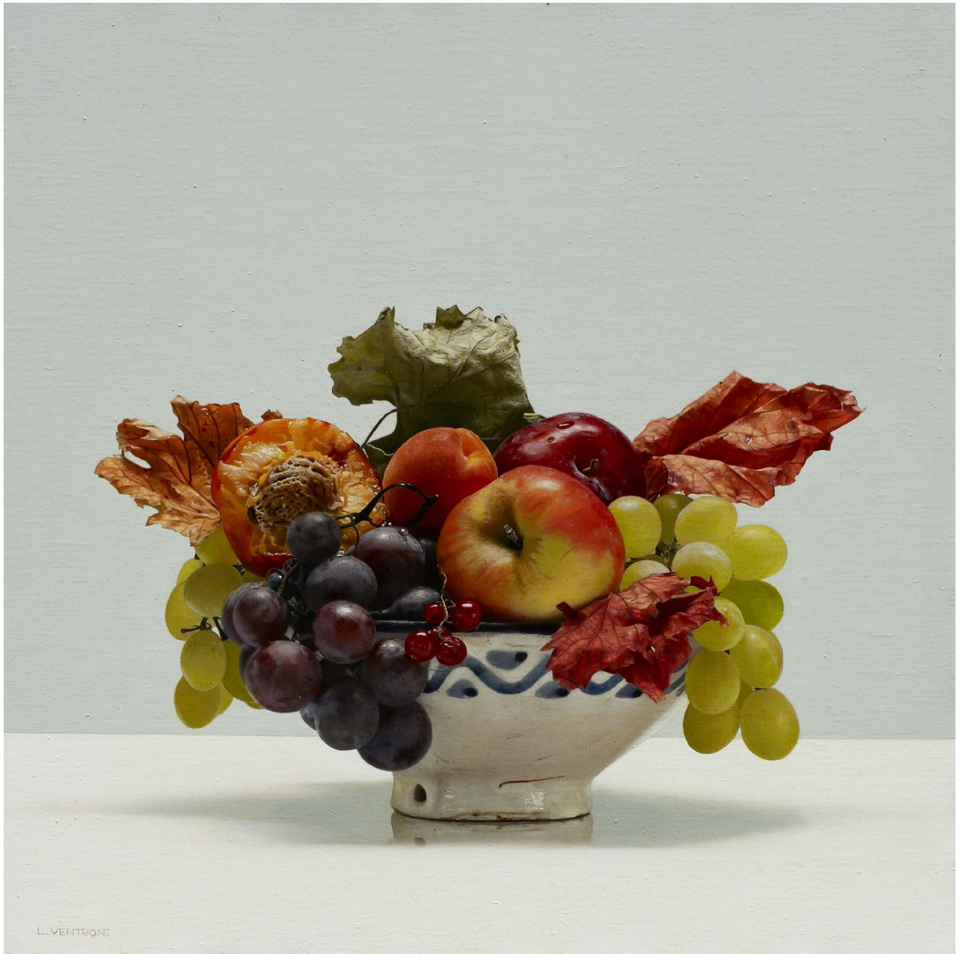
6. Quite 2013–2017 Oil on mixed media on linen 50 x 50 cm (19.7 x 19.7 in)