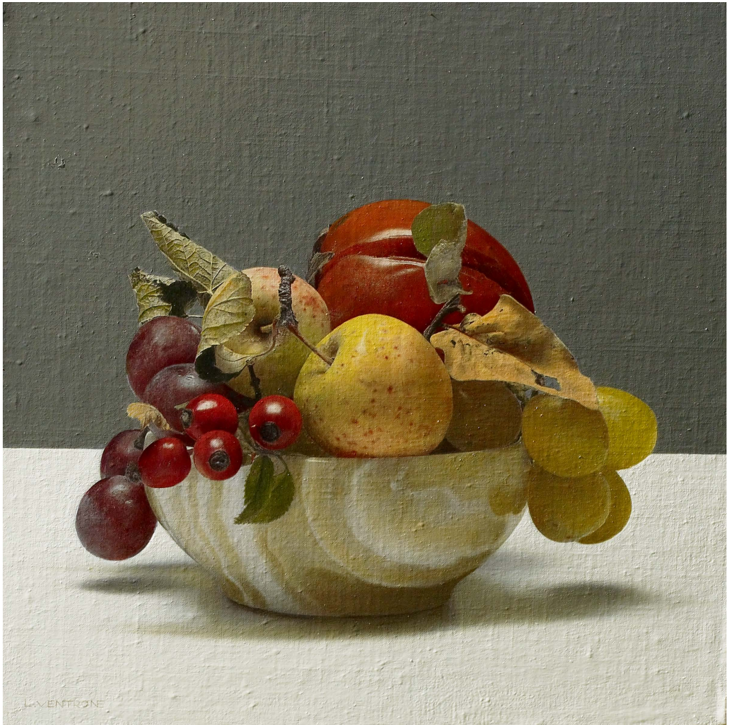
14. Silenzi 2 2010–2017 Oil on mixed media on linen on board 30 x 30 cm (11.8 x 11.8 in)