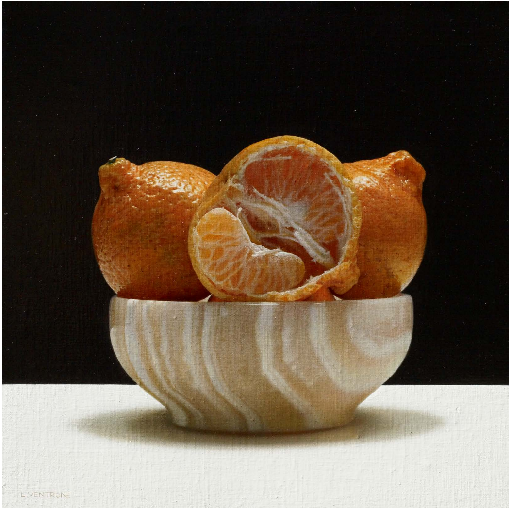
9. Spiritelli 2 2010–2017 Oil on mixed media on linen on board 40 x 40 cm (15.7 x 15.7 in)