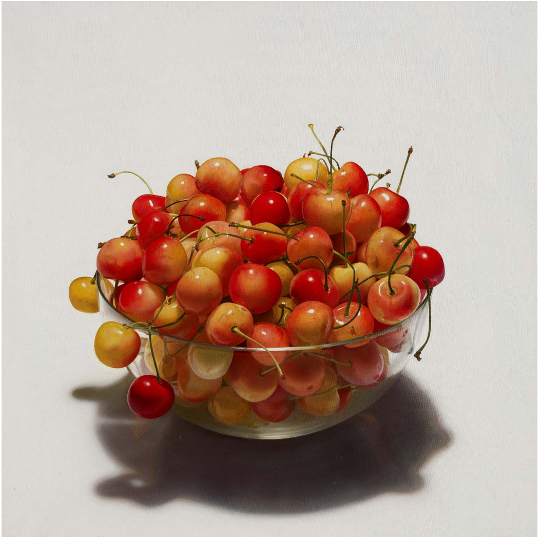
4. Voci 2015 Oil on mixed media on linen 60 x 60 cm (23.6 x 23.6 in)