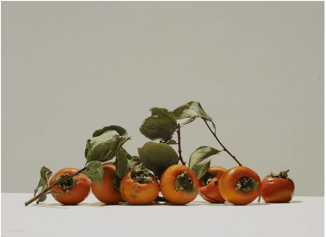
21. Viaggatori 2 2011–2017 Oil on mixed media on linen 60 x 80 cm (23.6 x 31.5 in)