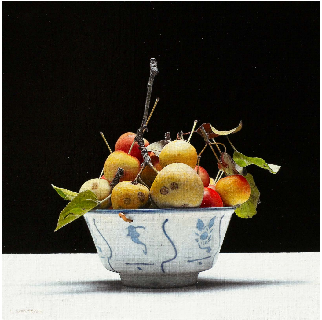
7. Antichi Sapori 2 2011–2017 Oil on mixed media on linen 30 x 30 cm (11.8 x 11.8 in)