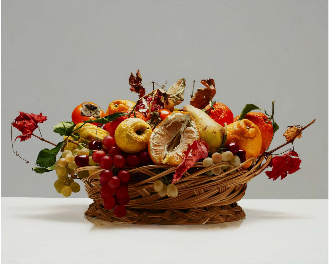
18. Ombre Impalpabili 2017 Oil on mixed media on linen 90 x 110 cm (35.4 x 43.4 in)