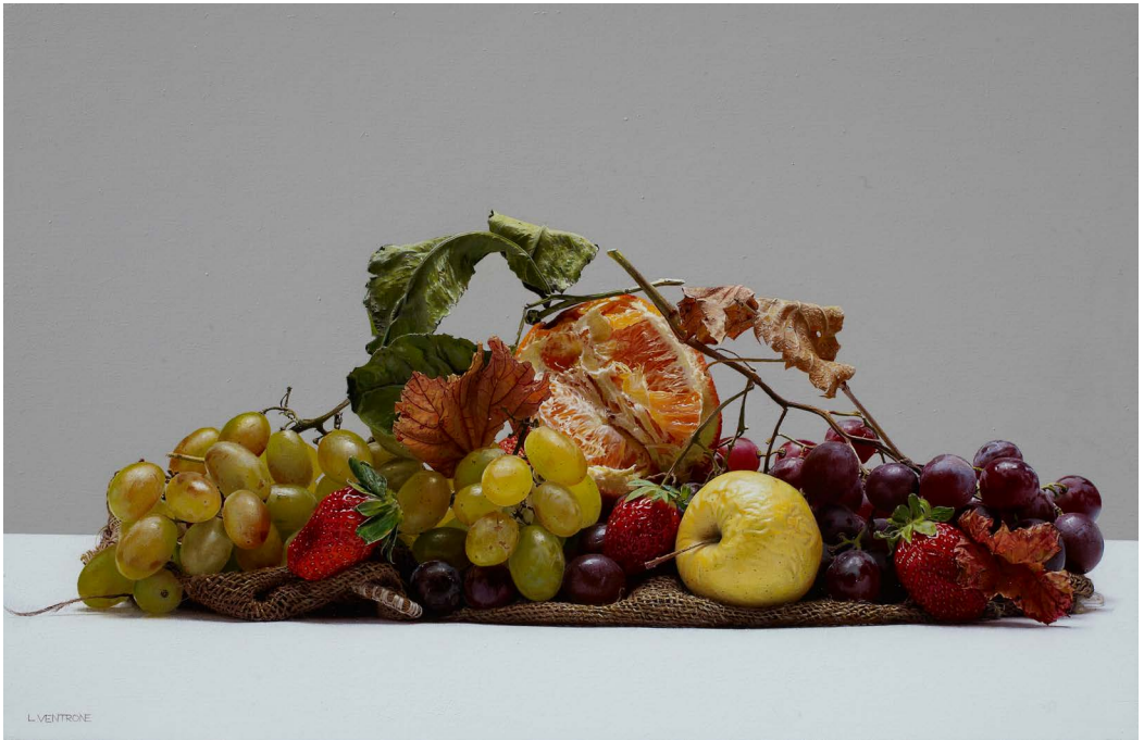
3. Riposo 2011–2016 Oil on mixed media on linen 40 x 60 cm (15.7 x 23.6 in)