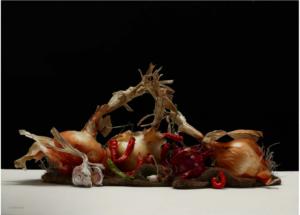
22. Storie Piccanti 2010–2017 Oil on mixed media on linen 50 x 70 cm (19.7 x 29.6 in)