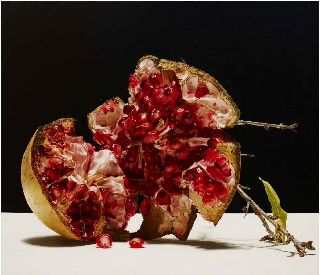
8. Attimi Successivi 2015 Oil on mixed media on linen 60 x 70 cm (23.6 x 27.6 in)