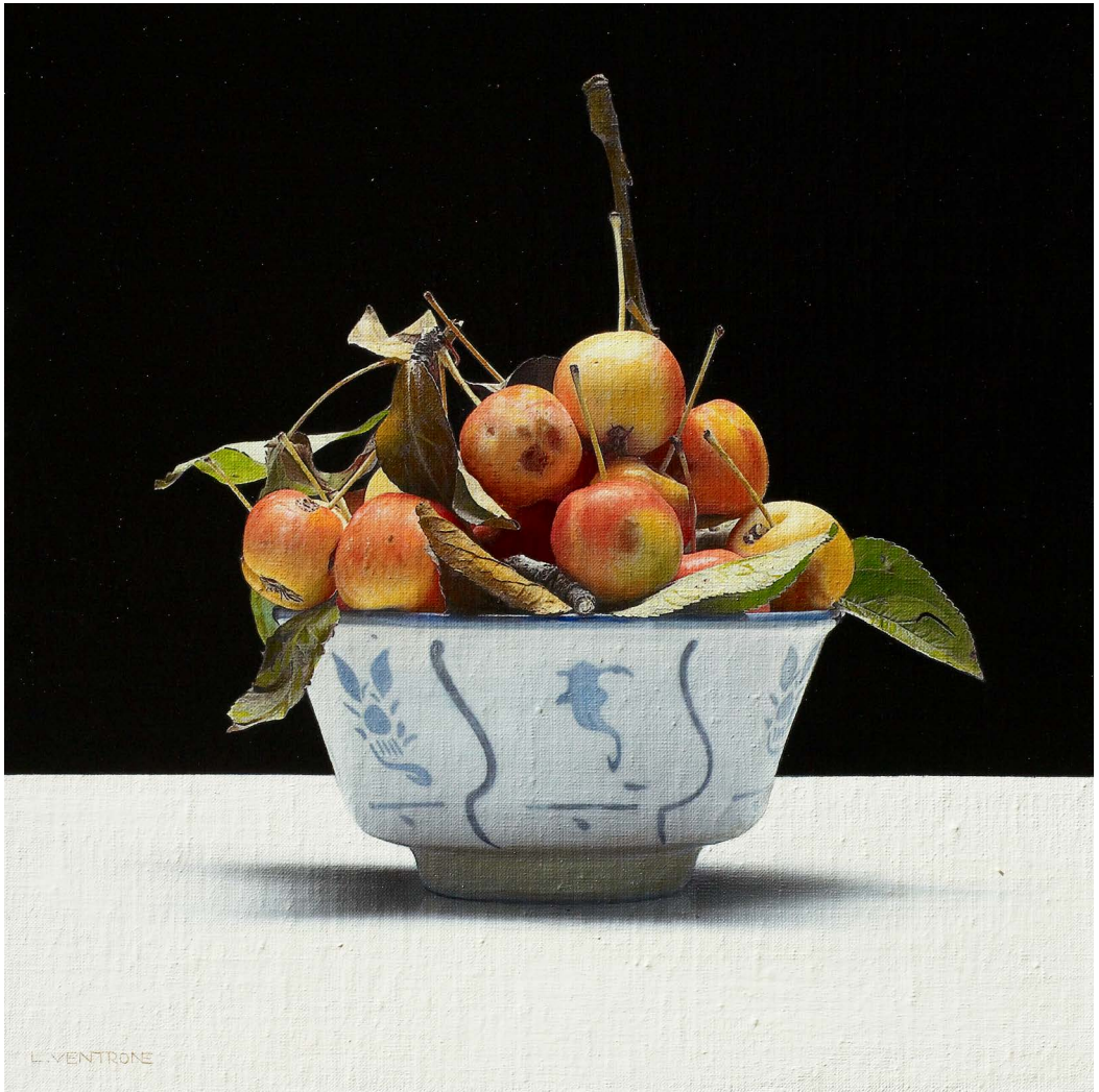
23. Antichi Sapori 2011–2017 Oil on mixed media on linen 30 x 30 cm (11.8 x 11.8 in)