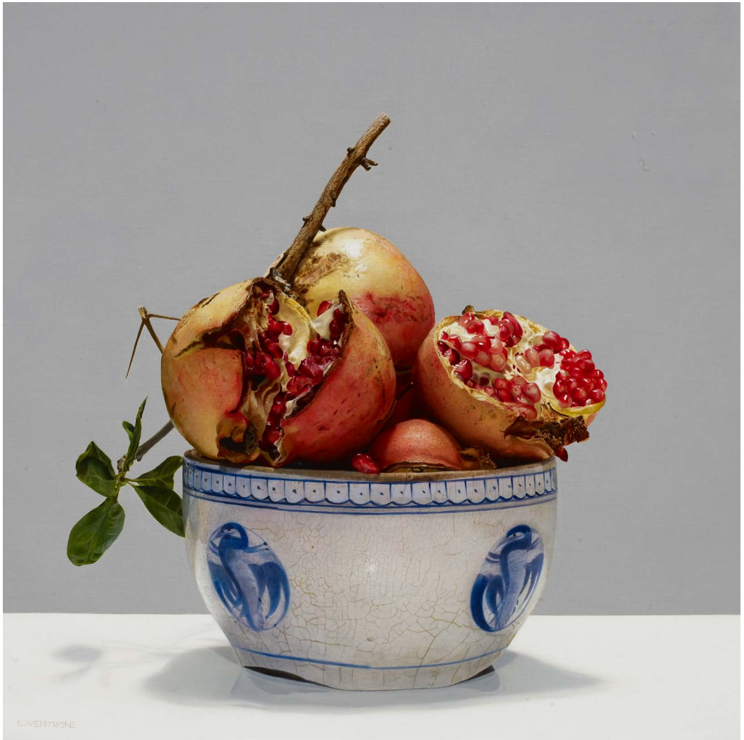
5. Eterno Presente 2010–2017 Oil on mixed media on linen 50 x 50 cm (19.7 x 19.7 in)