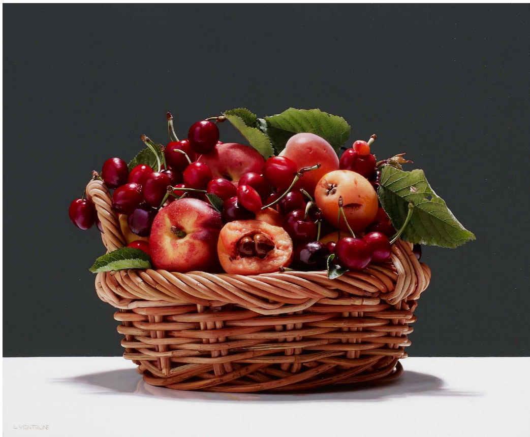
11. Percezioni 2013–2016 Oil on mixed media on linen 50 x 60 cm (19.7 x 23.6 in)