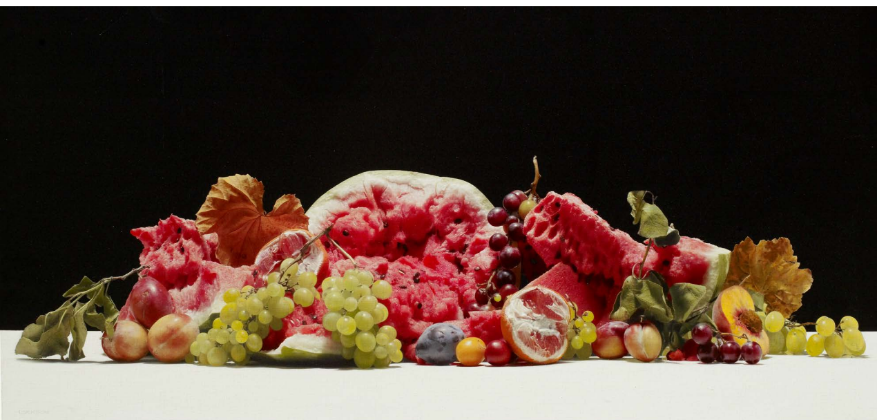
24. In Scena 2015–2017 Oil on mixed media on linen 55 x 115 cm (21.7 x 45.2 in)