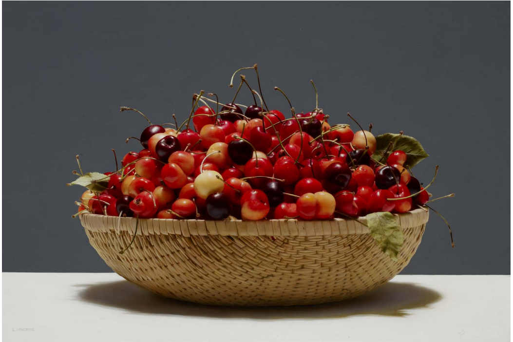
17. Coerenza Geometrica 2015–2017 Oil on mixed media on linen 60 x 90 cm (23.6 x 35.4 in)