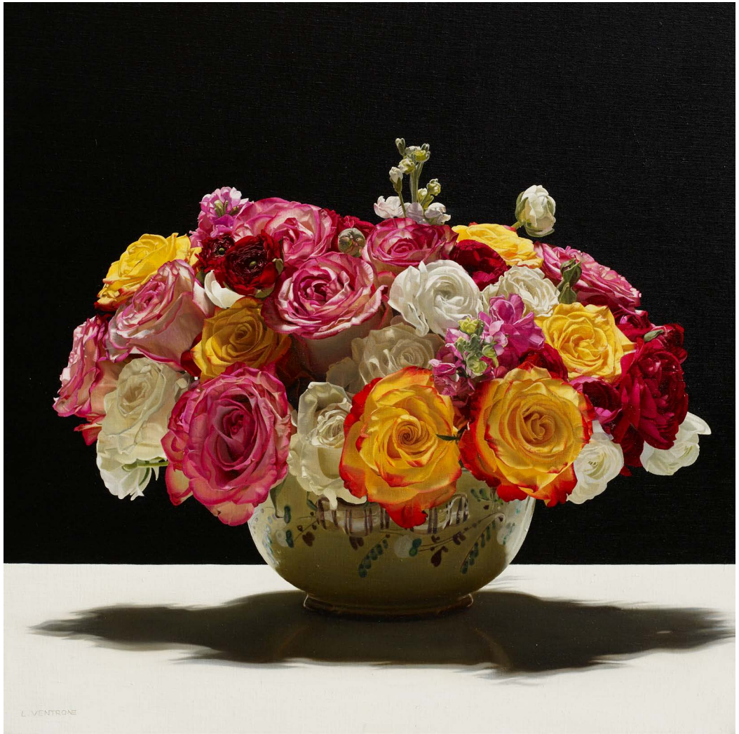
15. Regine e Reginelle 2015 Oil on mixed media on linen 60 x 60 cm (23.6 x 23.6 in)