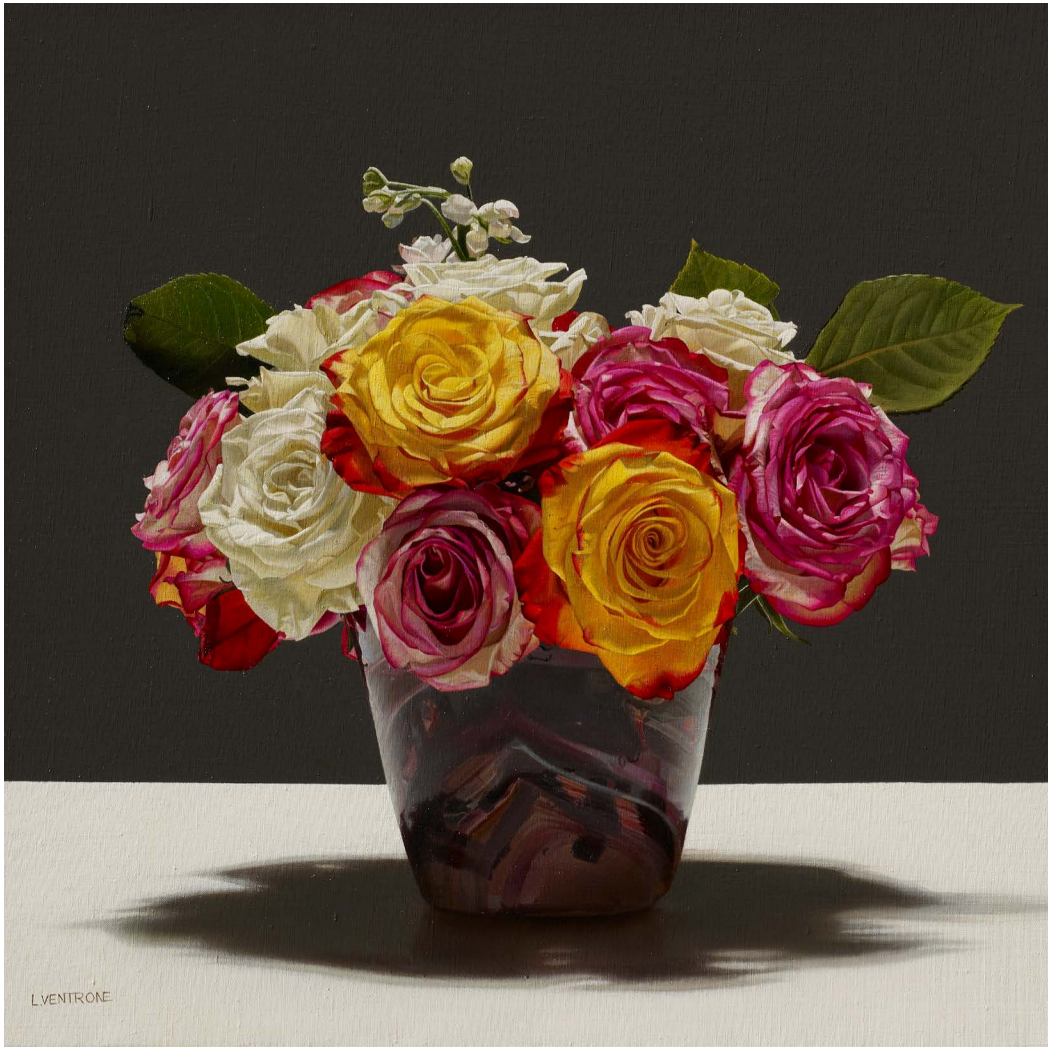
2. Urbe 2015–2016 Oil on mixed media on linen 50 x 50 cm (19.7 x 19.7 in)